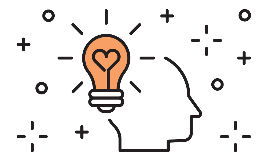
CHART YOUR OWN COURSE